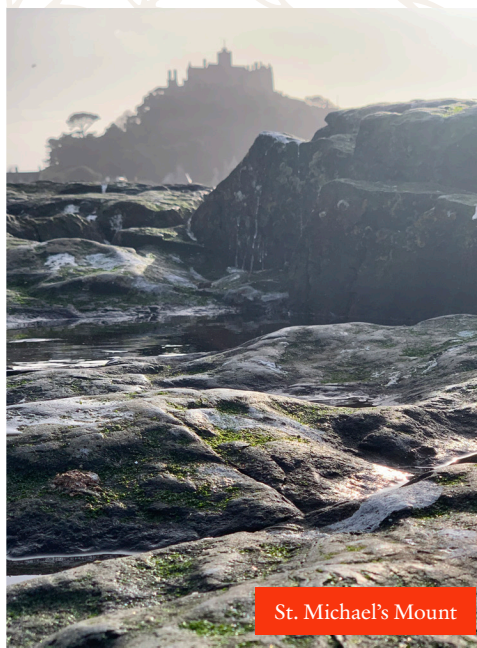
St. Michael's Mount