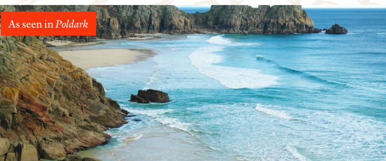
As seen in Poldark

The drive between the Botallack Mines and St. Ives is truly one you won't forget for its rugged beauty and stunning vistas. St. Ives will be our home for the next two nights. This stunning seaside community is known for a vibrant arts scene and unique attractions. Our accommodations in St. Ives will be the luxurious Pedn Olva Hotel, frequently rated as one of the best boutique hotels in Britain.