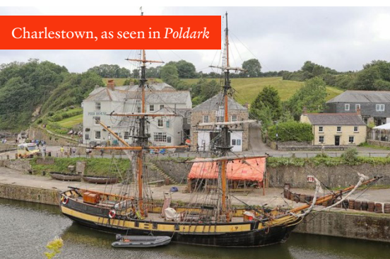
Charlestown, as seen in Poldark

Today after a delicious seaside breakfast, we will head to the gorgeous hidden gem of Fowey, filled with cobblestone streets, unique shops, architectural delights and charm. We will begin by hearing about the history of Fowey, and then you'll have some time to explore the village, do some shopping, sit along the picturesque waterfront or go into some of the village's historical buildings.