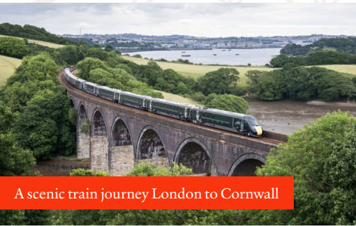
A scenic train journey London to Cornwall

* Due to AM train departures from London, we HIGHLY recommend that guests arrive to London prior to the first day of the tour.