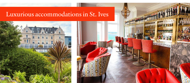
Luxurious accommodations in St. Ives