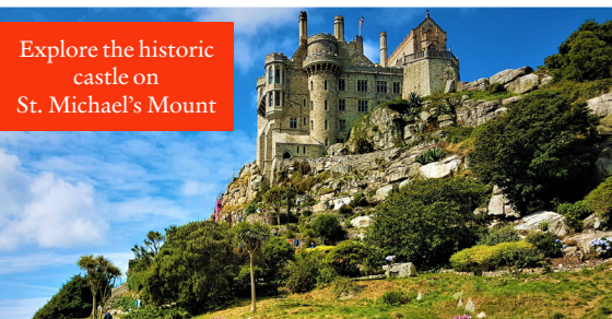
Explore the historic castle on St. Michael's Mount