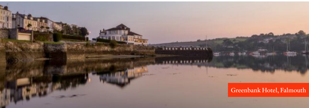
Greenbank Hotel, Falmouth