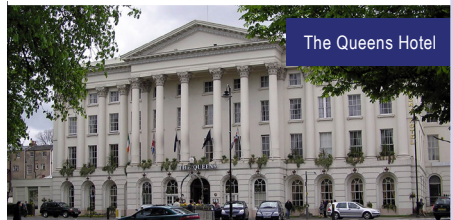
The Queens Hotel