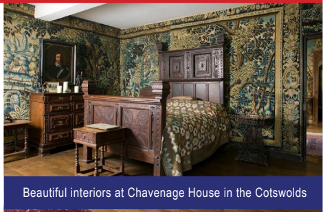
Beautiful interiors at Chavenage House in the Cotswolds