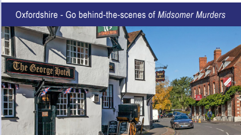
Oxfordshire - Go behind-the-scenes of Midsomer Murders