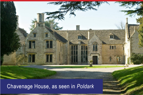
Chavenage House, as seen in Poldark