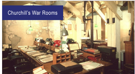
Churchill's War Rooms