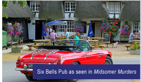
Six Bells Pub as seen in Midsomer Murders