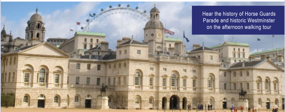
Hear the history of Horse Guards Parade and historic Westminster on the afternoon walking tour