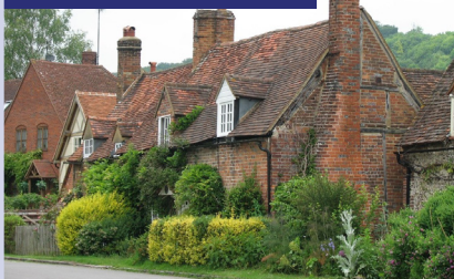
Turville, The Vicar of Dibley village