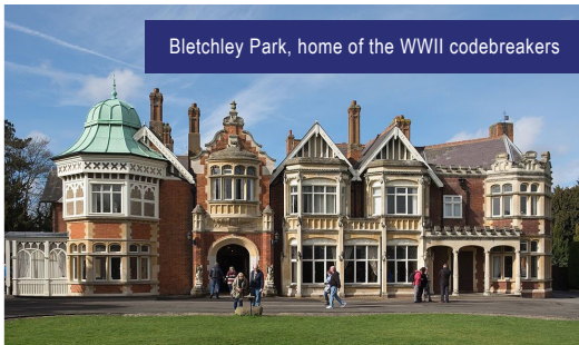
Bletchley Park, home of the WWII codebreakers