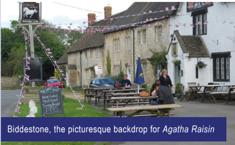
Biddestone, the picturesque backdrop for Agatha Raisin