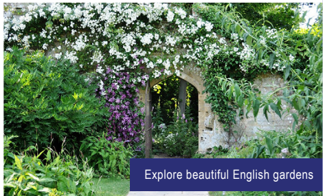
Explore beautiful English gardens