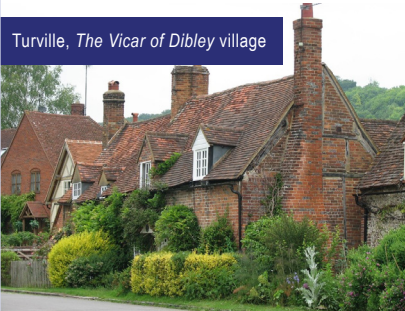
Turville, The Vicar of Dibley village