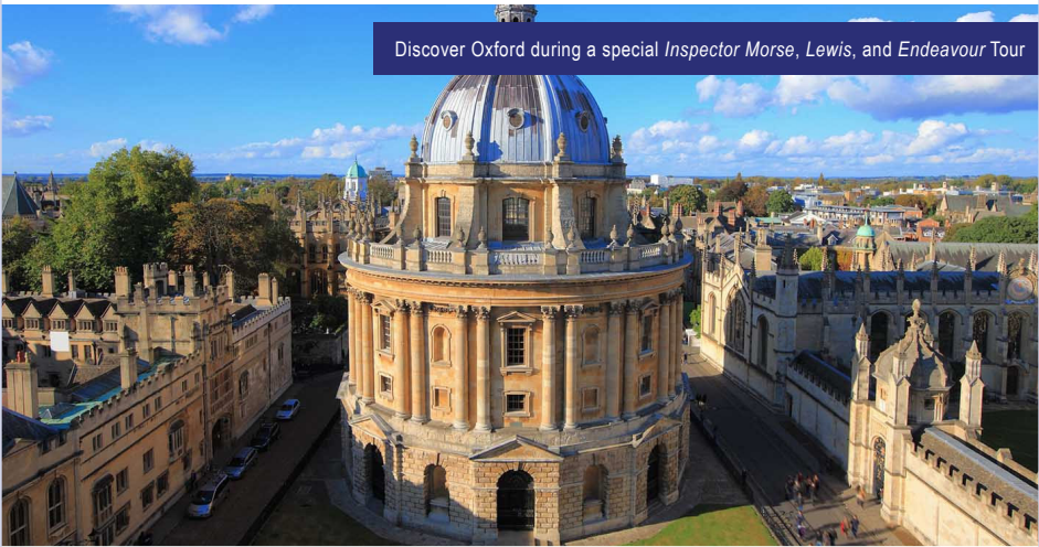
Discover Oxford during a special Inspector Morse, Lewis, and Endeavour Tour

Today, we will start the day in Oxford for a very special Inspector Morse, Lewis, and Endeavour tour of Historic Oxford, given by an expert on these wonderful programs and the iconic settings where they are filmed. In the afternoon, you will see the charming village of Biddestone in Oxfordshire — used as the backdrop of the series Agatha Raisin , based on the books by renowned author M.C. Beaton. Tonight, you will have an evening at your leisure to explore and dine at one of the great restaurants in Cheltenham, just steps from our hotel.