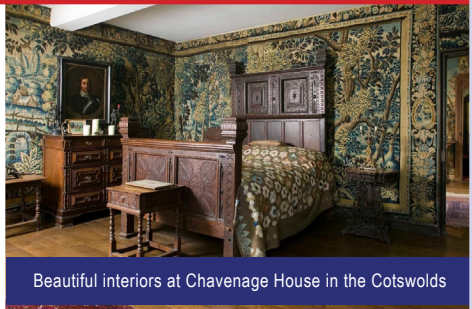
Beautiful interiors at Chavenage House in the Cotswolds