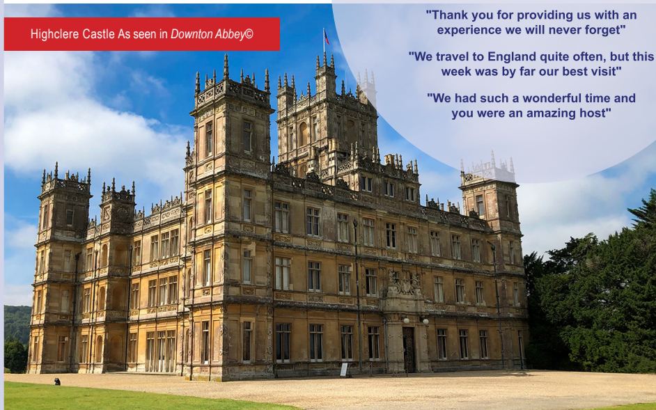
Highclere Castle As seen in Downton Abbey

"We had such a wonderful time and you were an amazing host"