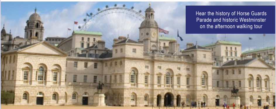
Hear the history of Horse Guards Parade and historic Westminster on the afternoon walking tour