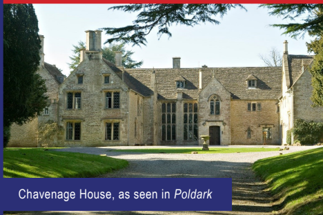
Chavenage House, as seen in Poldark