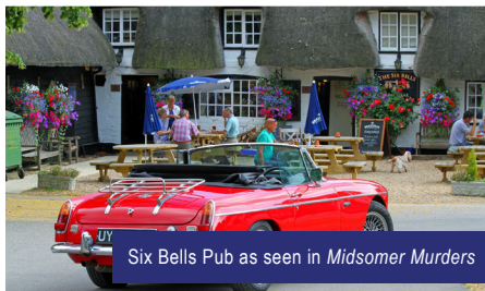
Six Bells Pub as seen in Midsomer Murders

Oxfordshire - Go behind-the-scenes of Midsomer Murders