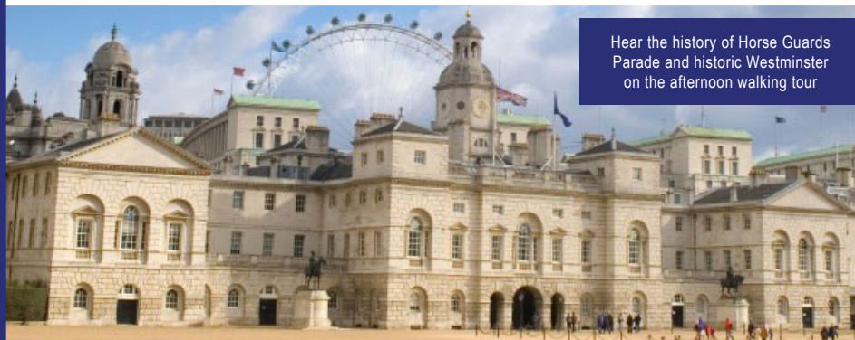
Hear the history of Horse Guards Parade and historic Westminster on the afternoon walking tour