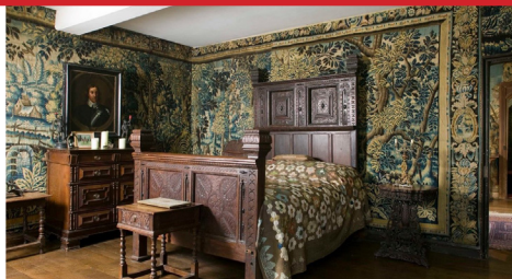
Beautiful interiors at Chavenage House in the Cotswolds