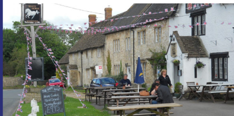
Biddestone, the picturesque backdrop for Agatha Raisin