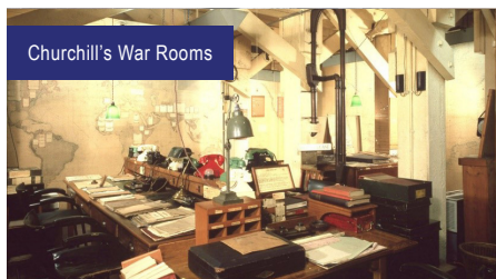
Churchill's War Rooms