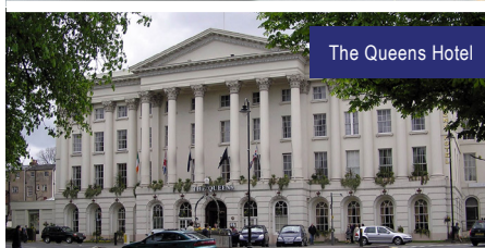
The Queens Hotel