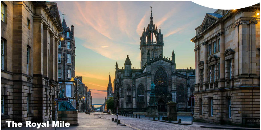
The Royal Mile