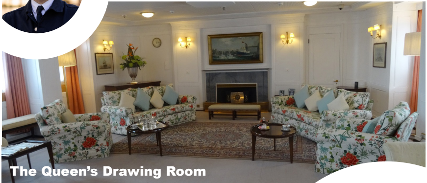
The Queen's Drawing Room

"This evening will be beyond special, and exclusive. Not many people get to experience this, and I'm sure this will be the highlight of the tour for many."