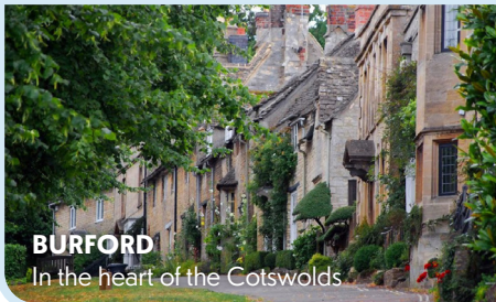
BURFORD In the heart of the Cotswolds