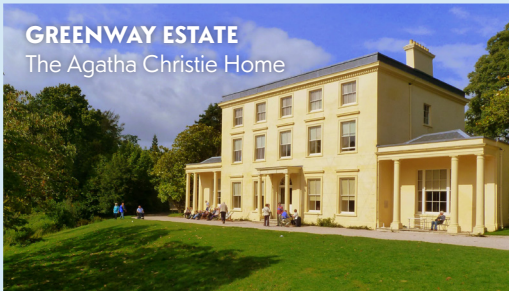
GREENWAY ESTATE The Agatha Christie Home

Today, we will explore the Greenway Estate, the beloved home and gardens of the world famous novelist Agatha Christie. Her estate is renowned for both its personal, lived-in feel and the simplicity. You'll quickly discover why she enjoyed using this as her holiday home and the place where she loved to write novels that we've come to love. This afternoon, we will stop at the quintessential seaside town of Torquay to hear about Agatha's life there. Torquay is famous for seaside fun as well as delicious ice cream. Tonight, we will dine in style in the beauty of our hotel, The Queens Hotel, Cheltenham.