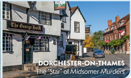
DORCHESTER-ON-THAMES The "Star" of Midsomer Murders