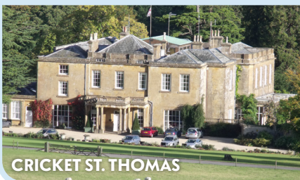
CRICKET ST. THOMAS