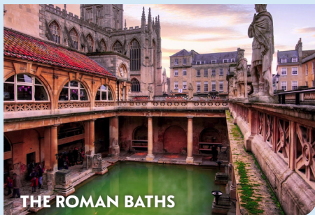
THE ROMAN BATHS