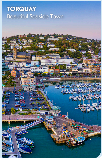
TORQUAY Beautiful Seaside Town