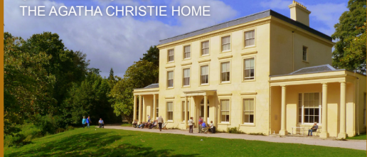
GREENWAY ESTATE THE AGATHA CHRISTIE HOME

This afternoon, we will stop at the quintessential seaside town of Torquay to hear about Agatha's life there. Torquay is famous for seaside fun as well as delicious ice cream. Tonight, we will dine in style in the beauty of our hotel, The Queens Hotel, Cheltenham.