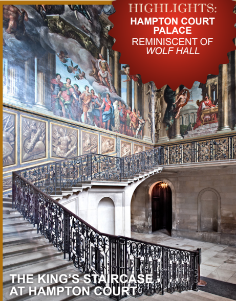
THE KING'S STAIRCASE AT HAMPTON COURT

HIGHLIGHTS: HAMPTON COURT PALACE REMINISCENT OF WOLF HALL