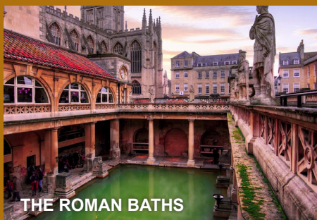
THE ROMAN BATHS