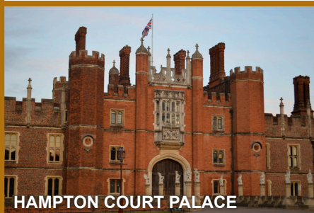
HAMPTON COURT PALACE

After our time at Hampton Court Palace, we will head into Central London (passing some of London's iconic sites along the way) to The Clermont, Charing Cross. Tonight we will dine in-style at our farewell dinner in London, where we will toast the great week we just had.