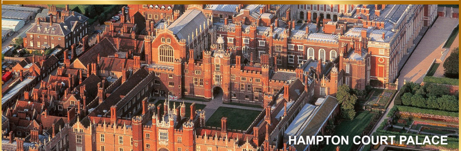
HAMPTON COURT PALACE