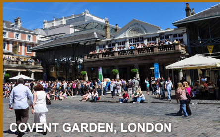
COVENT GARDEN, LONDON